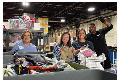
Post Grants Subcommittee Circle Works