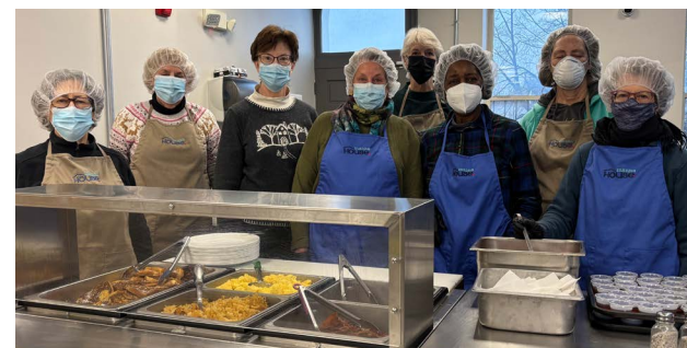
Circle Works subcommittee volunteering at Manna House